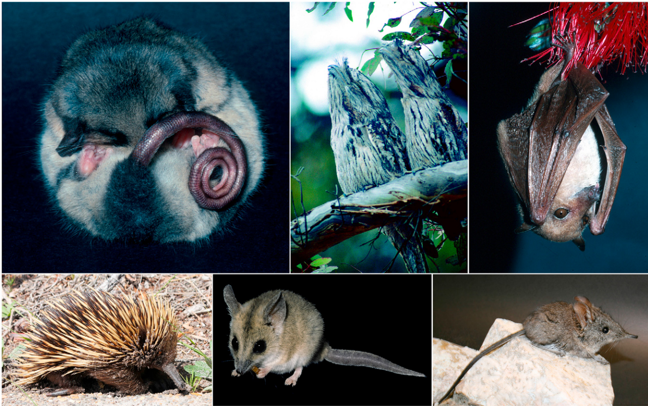
Figure 1. Heterothermy in the animal world.

Depicted is a sample of heterothermic species. The endangered mountain pygmy-possum ( Burrhamys parvus , 50g; top-left) is restricted to high mountain peaks of the Australian alps where it hibernates under snow-covered boulder fields for ~5–6 months. The possum adopts the typical ball-shape of many torpid hibernators, but it has been turned on its back to show head and appendages. The tawny frogmouth ( Podargus strigoides , 500g; top-middle) is found all over the Australian continent, enters daily torpor at night and/or in the early morning, and is the largest bird known to use torpor. The nectarivorous northern blossom-bat ( Macroglossus minimus , 16g; top-right) is distributed over tropical Australia and south-east Asia. It is one of the smallest megabats and enters daily torpor. The short-beaked echidna ( Tachyglossus aculeatus , ~3kg; bottom-left), an egg-laying mammal, is distributed over the entire Australian continent and hibernates in many areas. The fat-tailed dunnart ( Sminthopsis crassicaudata , 15g; bottom-middle), a dasyurid marsupial, is found in arid and semi-arid areas in the southern half of Australia and uses daily torpor throughout winter. The Cape rock elephant-shrew ( Elephantulus edwardii , 45g; bottom-right) is restricted to medium high elevations of South Africa and displays short-term hibernation. See Table 1 for a more comprehensive list of heterothermic species.